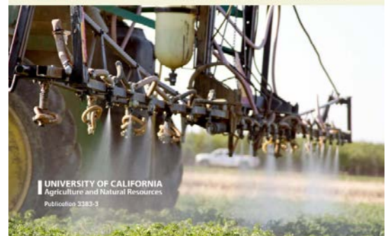
UNIVERSITY OF CALIFORNIA Agriculture and Natural Resources Publication 3383-3