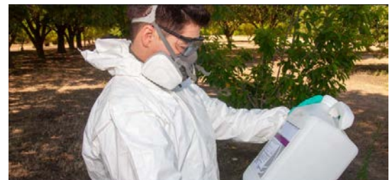
PESTICIDE SAFETY A STUDY MANUAL FOR PRIVATE APPLICATORS THIRD EDITION UC Statewide Integrated Pest Management Program

Please call our office at 209 (525)-4730 if you have any questions. You can also email us at agofficeduty@stancounty.com